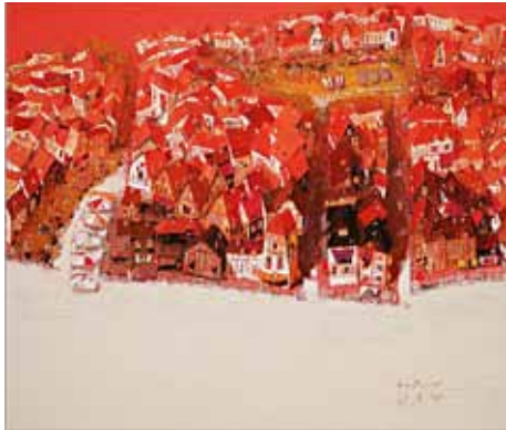
City of Color