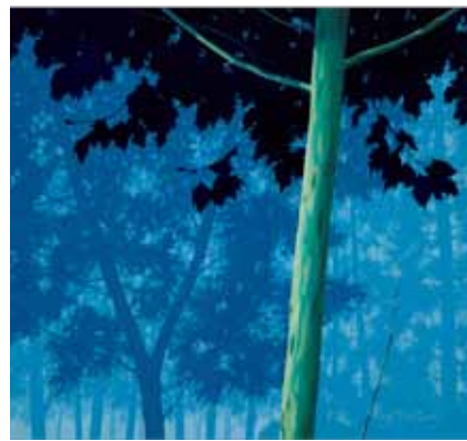
Nature Image 72.7x60.6cm Acrylic on Canvas