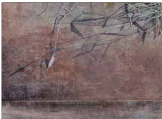
Conversation 65x91cm Mixed Media on Canvas