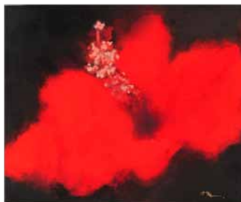
Invitation to Nature 72.7X60.6cm Crystal powder, Chinese ink, Powder Colour on Canvas