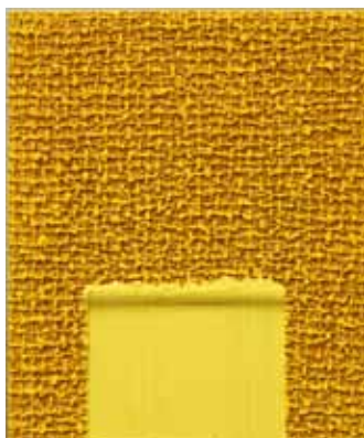
Contributory cause 60.6 x 72.7cm Mixed Media on Canvas