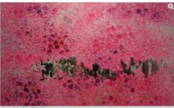
A work by Lee, Bum-Hun

By Ujjwala K. | Published: 29th July 2017 09:15 PM | Last Updated: 29th July 2017 09:15 PM | A+ A A- |