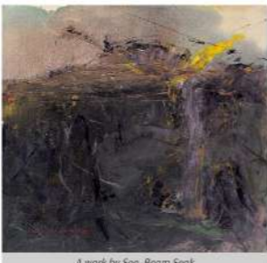
A work by Seo, Beom Seok

Exclusive to this edition, the biennial will feature artworks classified into two sections - abstract vignettes of nature in its myriad colours and contemporary depictions of ancient Korean art forms.