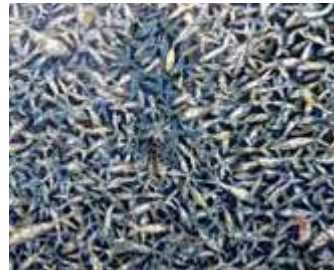
Suraj Nagwanshi (Painting)