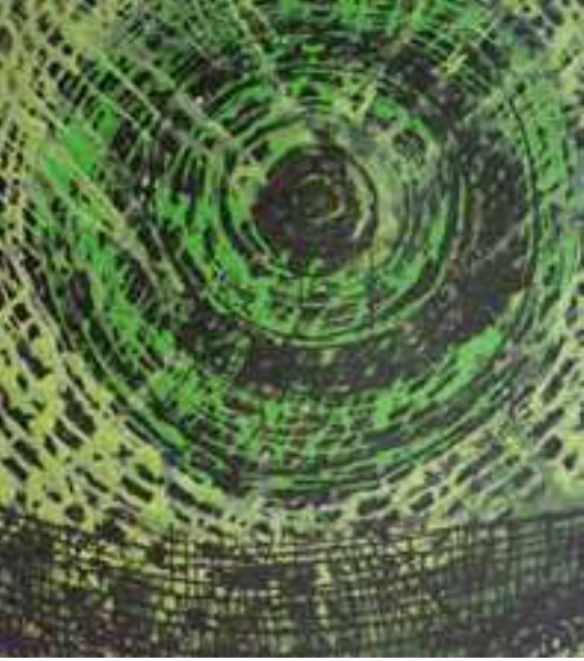
028 Gyre, 66.5x56, Acrylics on canvas, 2018.