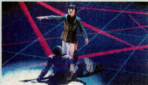
THINKING DIFFERENTLY A scene from Beyond Binary

The script is based on several interviews with sexual minorities across India and Korea. "We chose cases that describe different aspects of sexual identity. I requested per-