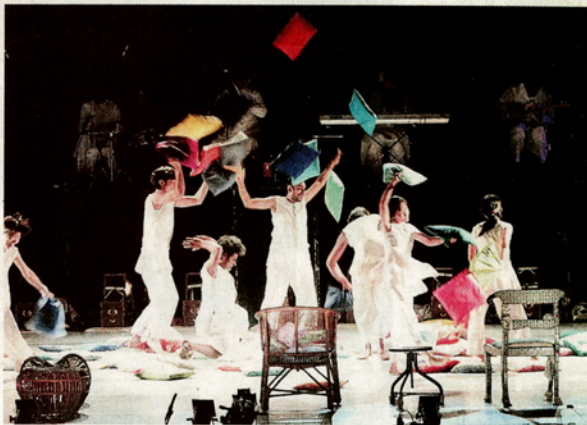
BREAKING BOUNDARIES ' Beyond Binary ' made the audience question pre-conceived notions of gender

A few situations could have been enacted instead of the abstract discourse. Probably, the script writer could have explored the lighter side of