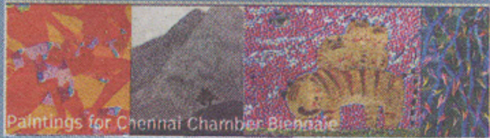
Paintings for Chennai Chamber Biennale

Lalit Kala Akademi, InKo Centre and K-Art is organising the Chennai Chamber Biennale, the second curated event in a series of bi-annual exhibition of contemporary paintings from