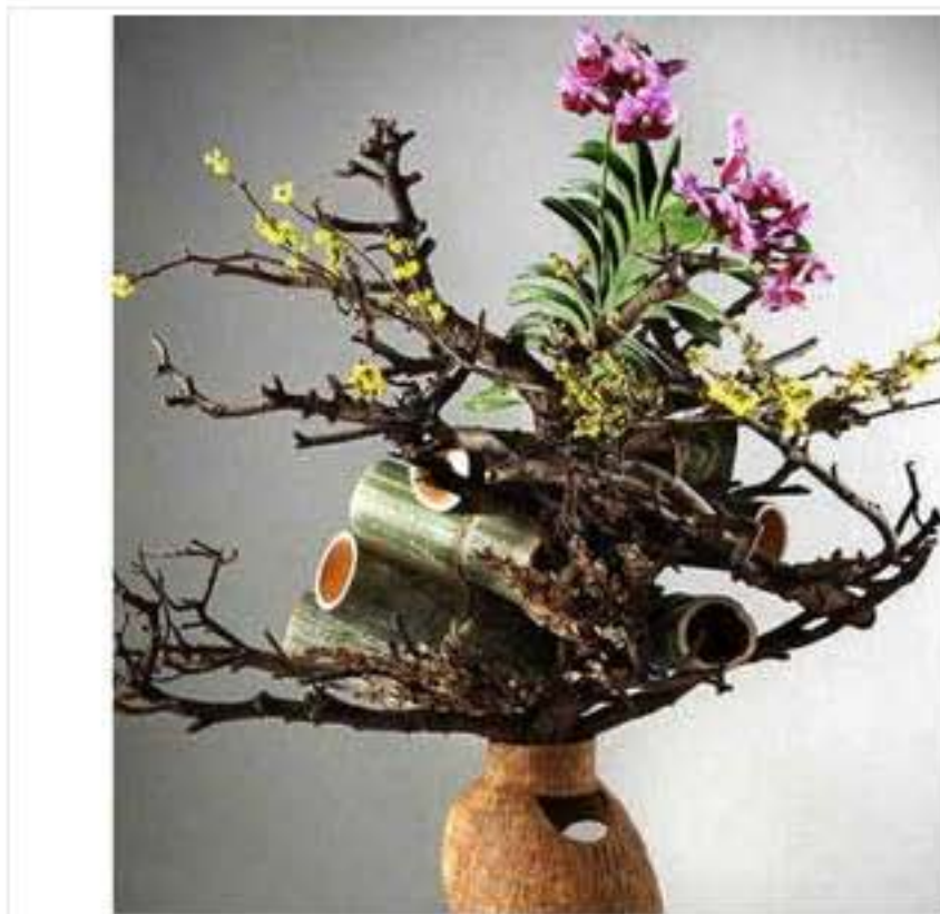
Ggotggozi, the art of Korean flower arrangement

Ggotggozi, the art of flower arrangement, is being showcased in the city.