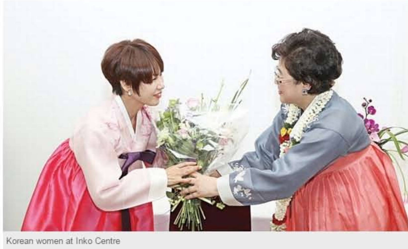
Korean women at Inko Centre

By Roshne B | Published: 25th June 2016 04:20 AM Last Updated: 25th June 2016 04:20 AM