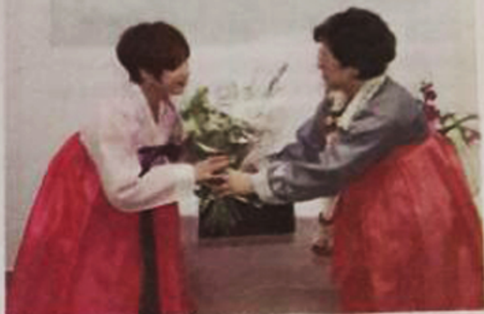
Korean women at Inko Centre