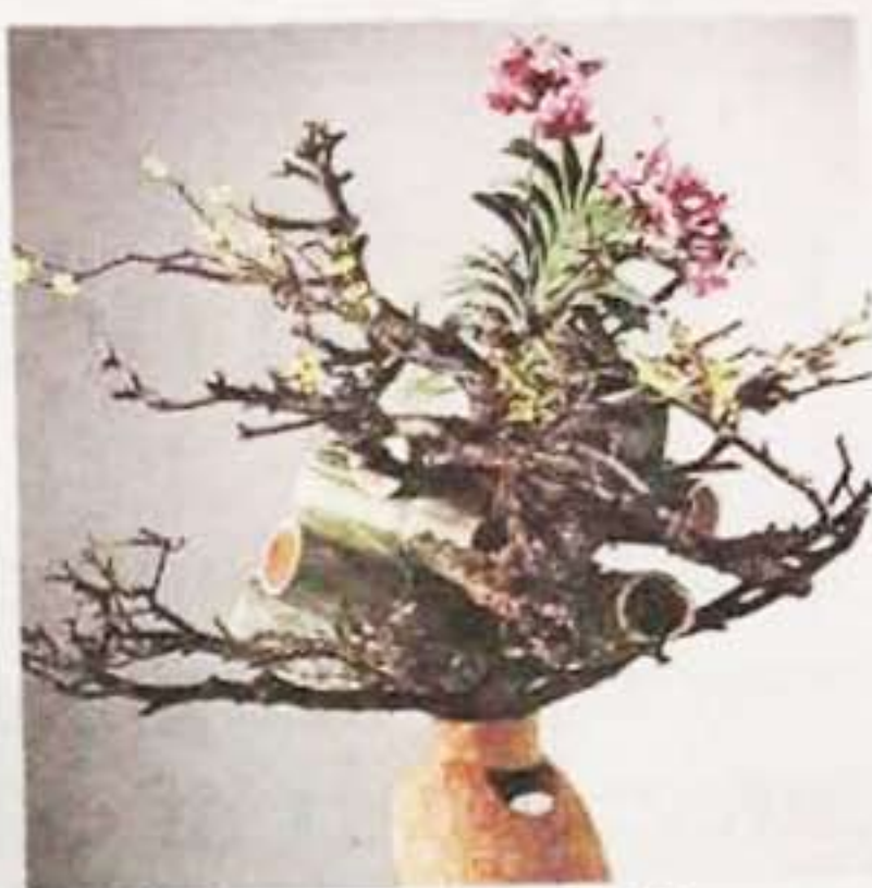
Ggotggozi, the art of Korean flower arrangement

"The occasion determines the style of arrangement. Sometimes the western style is amalgamated. Both indigenous and imported flower varieties are used. Korean tradition records five intrinsic