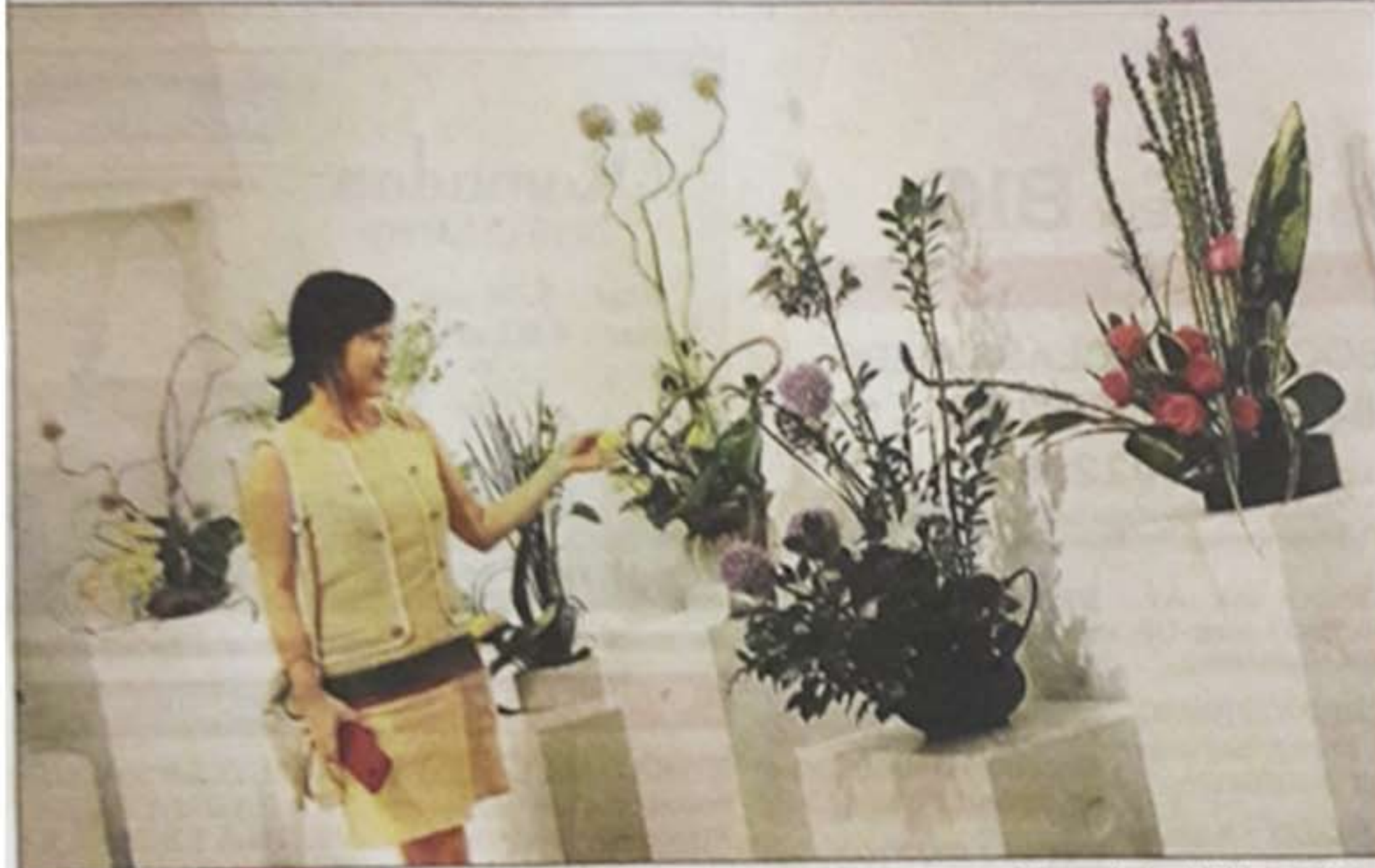
KOREAN CREATIVITY: A woman checks the floral arts on display at a Korean Flower Art exhibition at InKo Centre on Adyar Club Gate Road. The exhibition used flowers imported from Korea