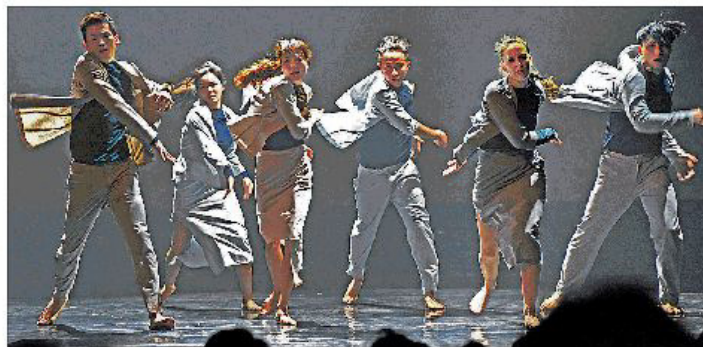
Artistes from Second Nature Dance Company, Gamblerz and Animation, South Korea, perform at Attakkalari India Biennial at Chowdiah Memorial Hall on Friday.

This year's theme is 'BLR Moves' where the festival is featuring a host of performers and delegates from across the globe. The first troupe to delight the art enthusiasts of Bengaluru was Second Nature Dance Company from South Korea which came up with 'R U ready?'. An intense production, it posed the question of whether one is ready to reflect on their inner self and face the world as they truly are, after being