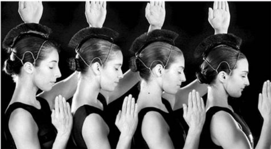
A file picture of the Attakkalari dancers

Venue: Ranga Shankara, Chowdiah Memorial Hall, Gurunanak Bhavan, Alliance Française de Bangalore, and Christ University