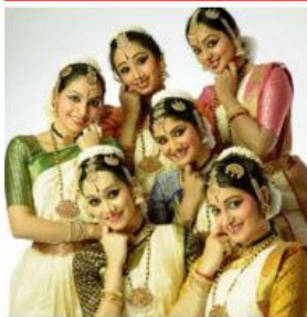
Students of the Rasika Dance Ensemble