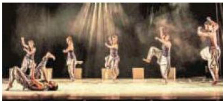
The Attakkalari biennial will feature dancers from 20 countries.