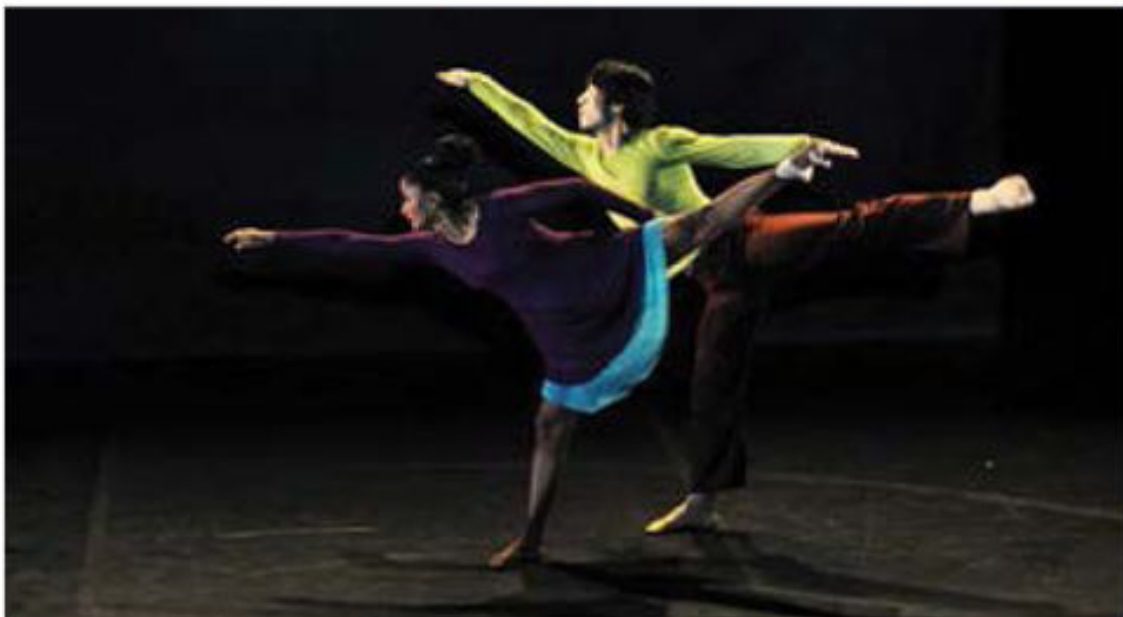
A file picture of the Attakkalari dancers

Venue: Ranga Shankara, Chowdiah Memorial Hall, Gurunanak Bhavan, Alliance Française de Bangalore, and Christ University