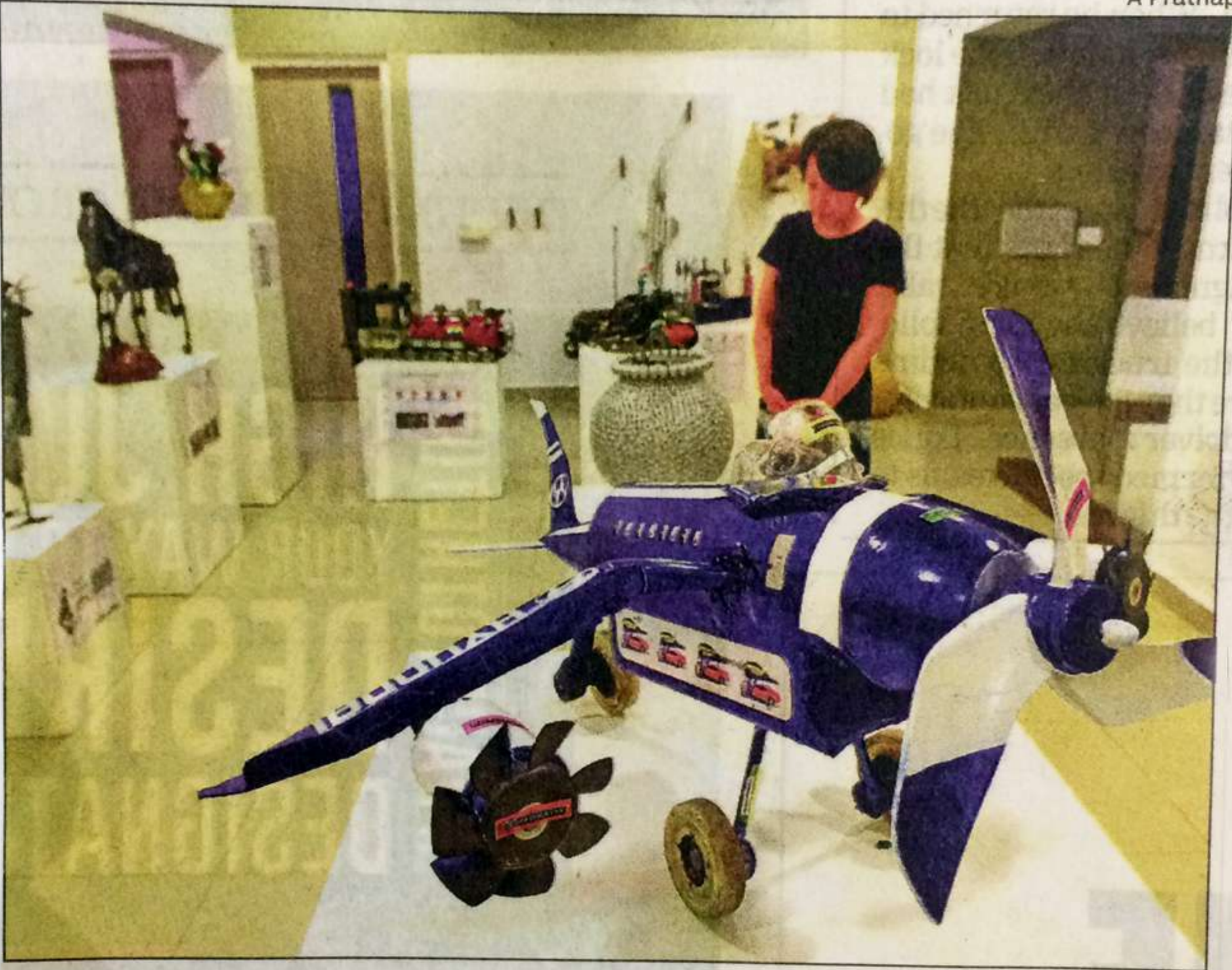
CREATING ART FROM WASTE: A visitor takes a look at exhibits made out of scrap by the employees of Hyundai at the InKo Centre