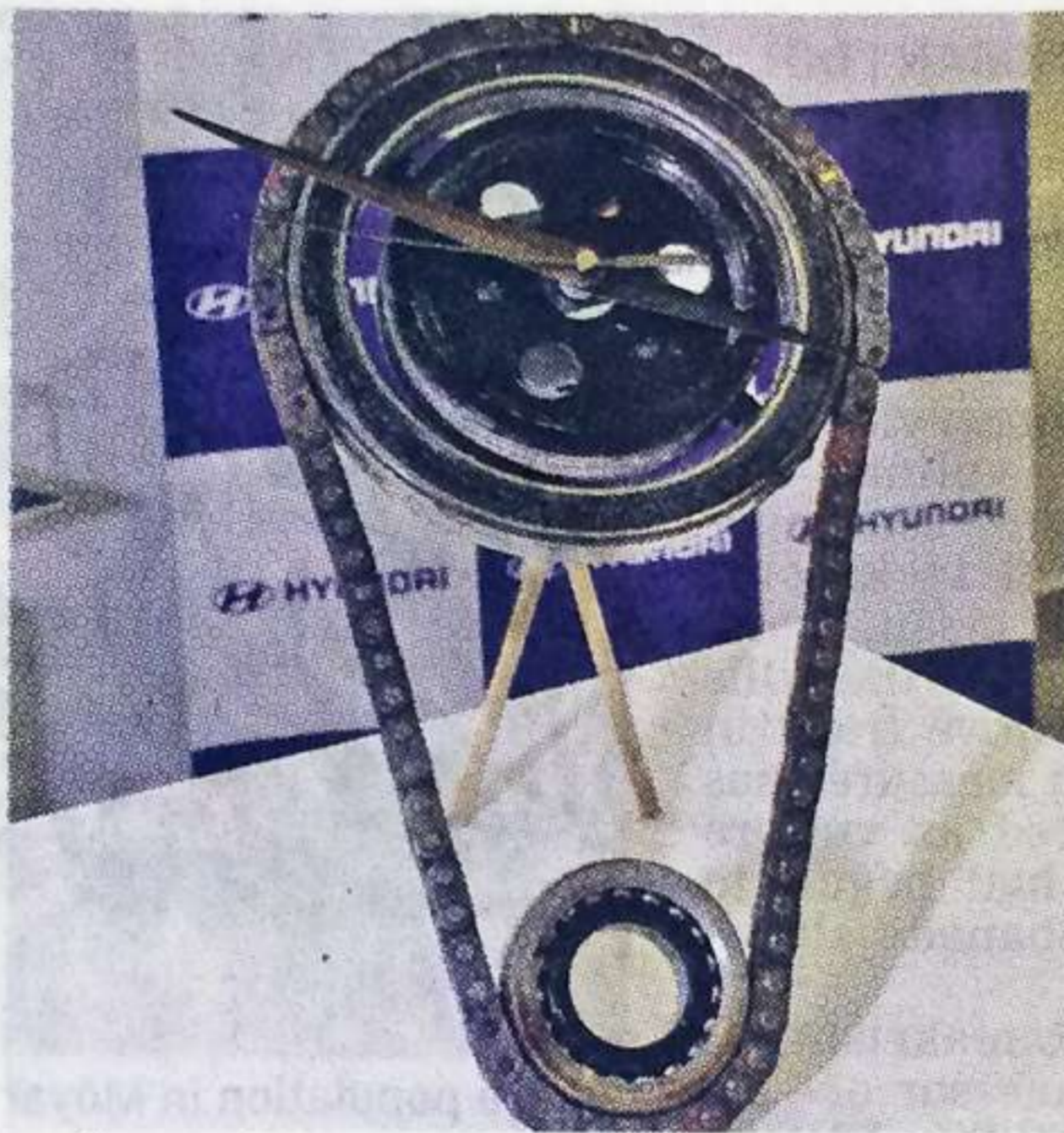
Watch made by the employees of Hyundai Motors using scrap material.

Their making style could be difficult, but the underlined message is the same, that waste is not useless, but a productive item. It also sensitises people about the ways of environmental conservation, besides displaying the teamwork of the employees at the auto-