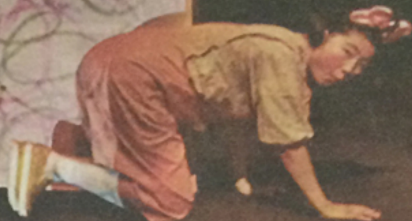
From the play Yao Yao

A THEATRE FESTIVAL FOR KIDS AIMS TO INSTILL ESSENTIAL QUALITIES LIKE INCLUSIVITY AND COMRADESHIP IN CHILDREN