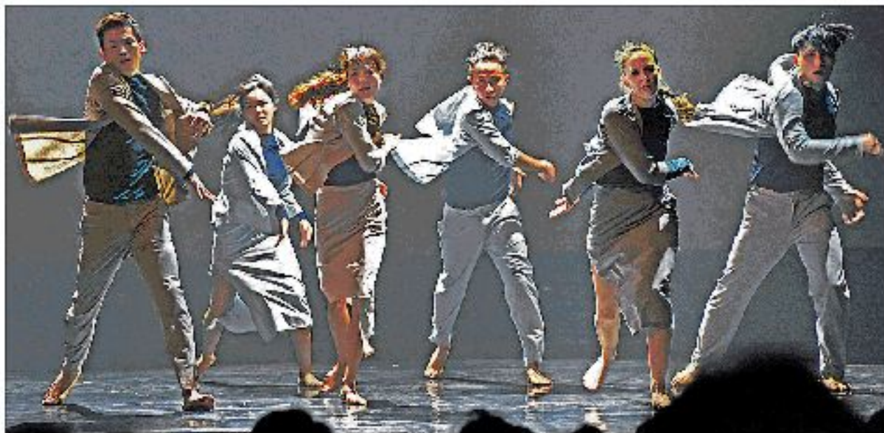
Artistes from Second Nature Dance Company, Gamblerz and Animation, South Korea, perform at Attakkalari India Biennial at Chowdiah Memorial Hall on Friday.

This year's theme is 'BLR Moves' where the festival is featuring a host of performers and delegates from across the globe. The first troupe to delight the art enthusiasts of Bengaluru was Second Nature Dance Company from South Korea which came up with 'R U ready?'. An intense production, it posed the question of whether one is ready to reflect on their inner self and face the world as they truly are, after being