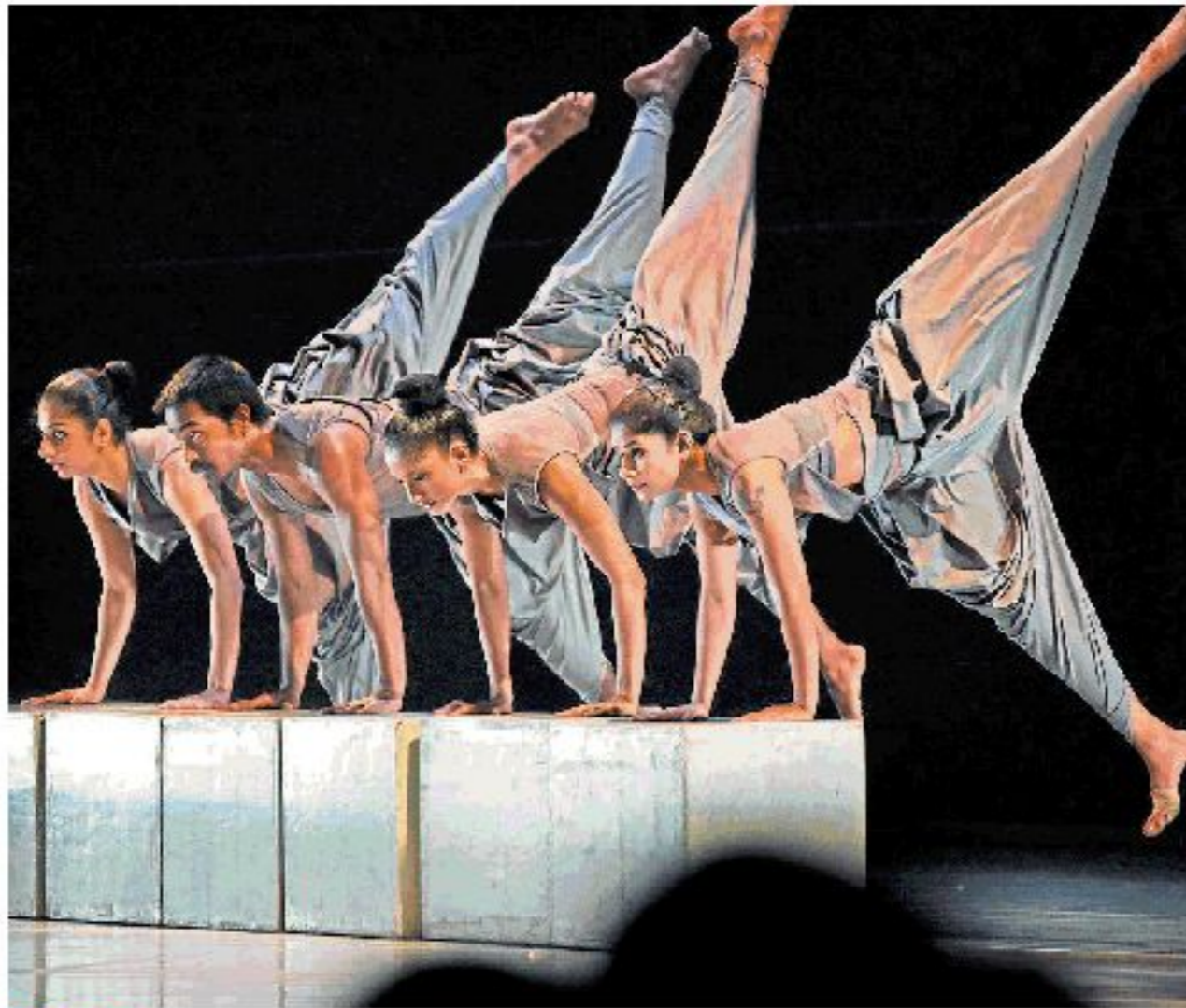
ELEGANT 'Bhinna Vinyasa' by Attakkalari Repertory Company.

About the challenges, he said, "We had to explain the cultural specifications idea to the international audience which was a bit challenging. We had to draw a new path to bring in the balance. But it was perfect as it brought in