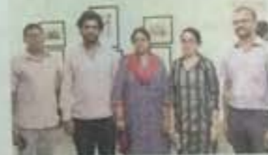
The twain do meet The artists and curator of Traversing Tradition

As the name suggests, the exhibition is an exploration of the intersection between the so-called "traditional" and "contemporary", highlighting that the two are not mutually exclusive terms but "realms that intriguingly overlap