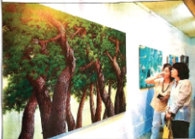
TRIAL, INDIA: The fourth edition of Chennai Biennale presented by InHo Centre with K-Art International Exchange Association, Korea, was on Thursday launched at Lalit Kala Akademi on Green Road. 'Beyond the Frame' features works by both emerging and established artists and highlights their techniques of interpreting the Korean cityscape, villages, beaches, farms and farms. It will be on till October 1