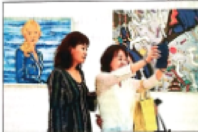
IN TRIALL: Visitors at the exhibition on Thursday