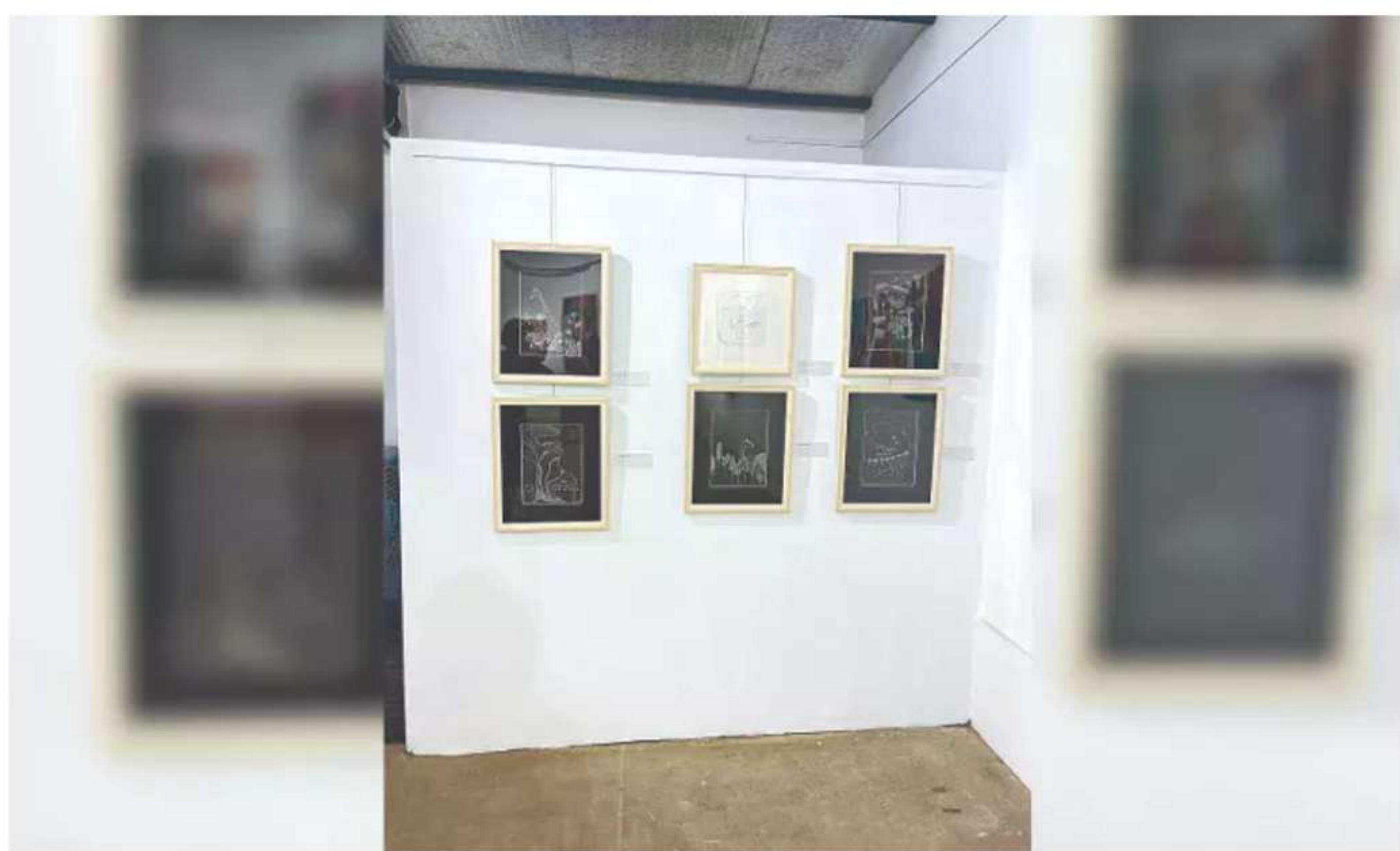
From the exhibition

DTNEXT Bureau | 20 July 2023 7:00 AM ( Updated: 20 July 2023 7:01 AM )