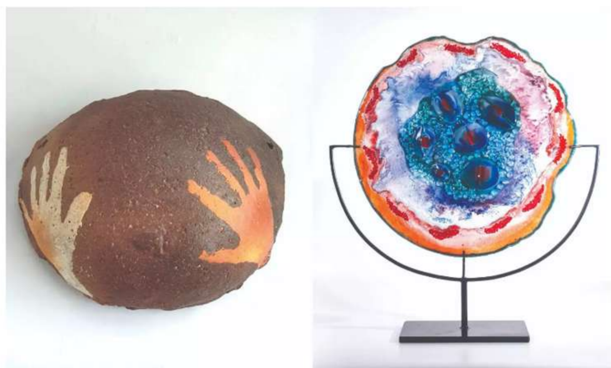
Ceramics creation by Kaveri and Glass artwork by Radhika

From transparent paper planes caught in midflight to small whimsical whistles growing on a tree; from pregnant belly forms holding the impression and memories of the child within to myriad hues of broken and melted bangles that question superstitions - this exhibition is but a glimpse into the process, playfulness, and ponderings of Kaveri and Radhika.