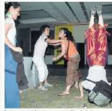
Korean group doing some unconventional steps