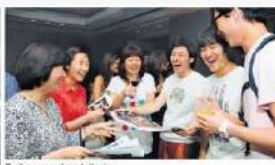
The Koreans say cheers to theatre