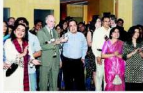
A section of the crowd listening to the speeches