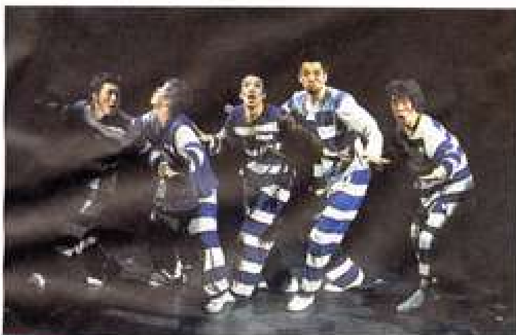
HYPER APPROACH 'Break Out: Extreme Dance Comedy'

"Break Out: Extreme Dance Comedy" fuses street dance and hip-hop music to tell a story that also makes you think