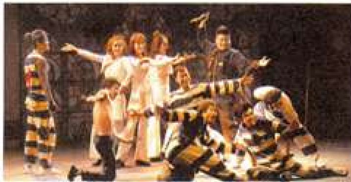
NON-STOP ENTERTAINMENT From 'Break Out: Extreme Dance Comedy'