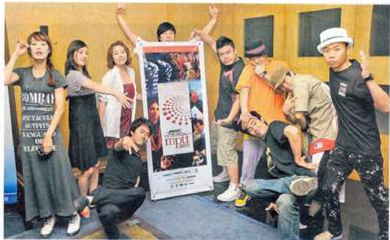
Members of the Sevensense and Yegam Theatre Company from Korea who will open The Hindu MetroPlus Theatre Fest 2010 with the dance comedy 'Break Out' on Friday.

The sixth edition of the fest features eight world-class plays from Korea, Singapore, the U.S., Bangalore, New Del-