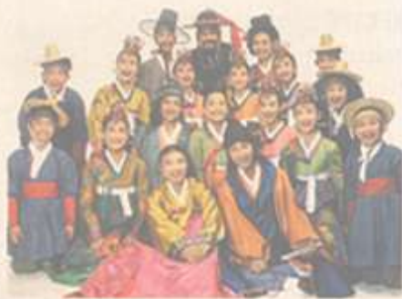
SPREADING CHEER 'Choon Hyang' by Theatre Seoul

lin, is puppet theatre for children aged between three and six years. The story, which bounces with coloured shadows and live music, features Little Matti and his big friend Totto figuring out what 'O' can be made into. "A monster with which they can play hide and seek, a captive balloon with which Matti travels through the air, a car with which he explores the world." Finally, there's 'Choon Hyang' by Theatre Seoul based on a famous Korean folktale. It is a musical in English that incorporates Korean music, dance and movement. The costumes here, made of