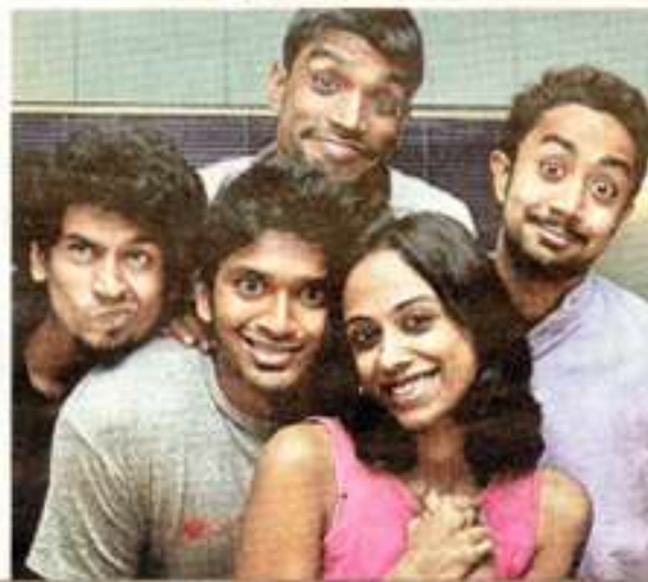
PH: A Raja Chidambaram

The Little Festival is on from June 10 to June 19 at Museum Theatre. Passes (Rs 200) will be available at Landmark, Oxford Bookstore, Gatsby and ProMusicals. Details: 28211115