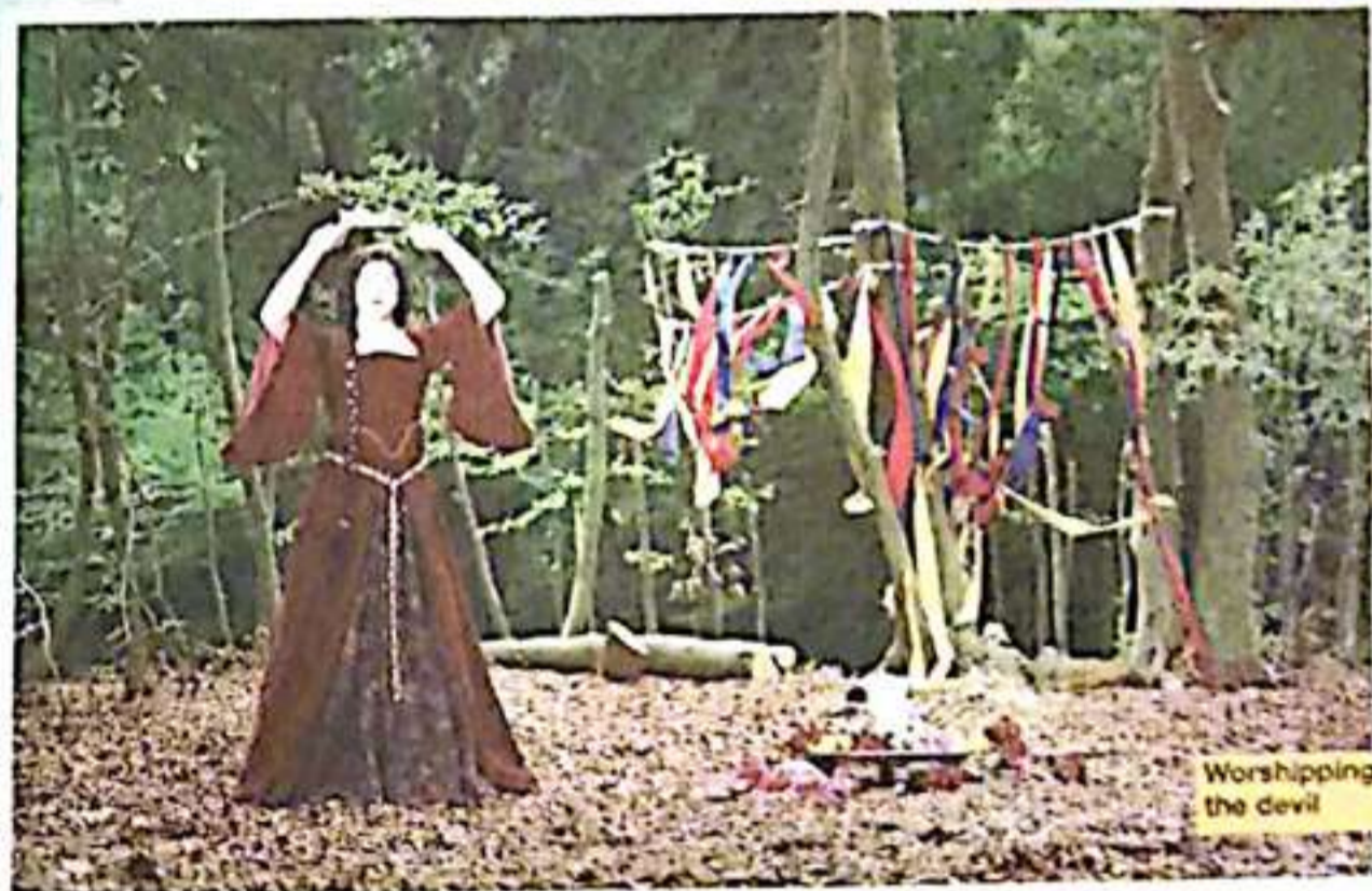
Worshipping the devil

Recalling his first-ever visit a Hindu temple, he says, "I saw people offering their prayers very sincerely and I was fascinated by that.