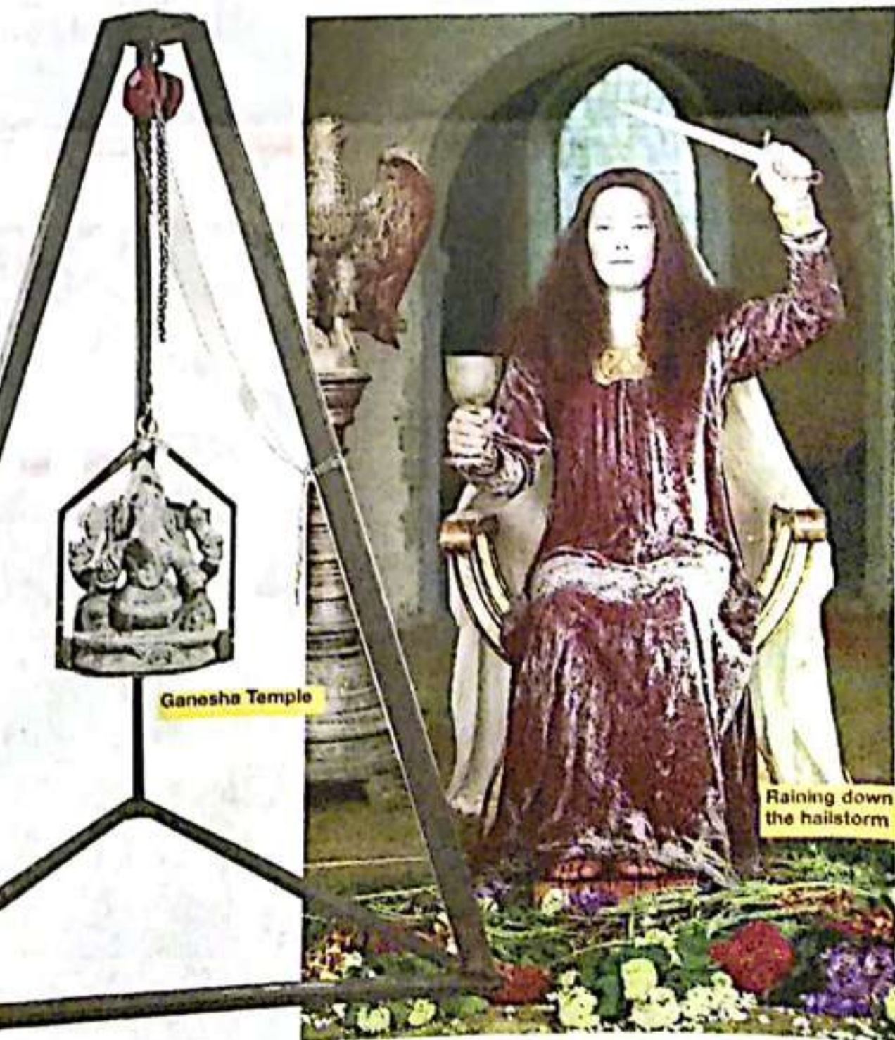
Raining down the hailstorm