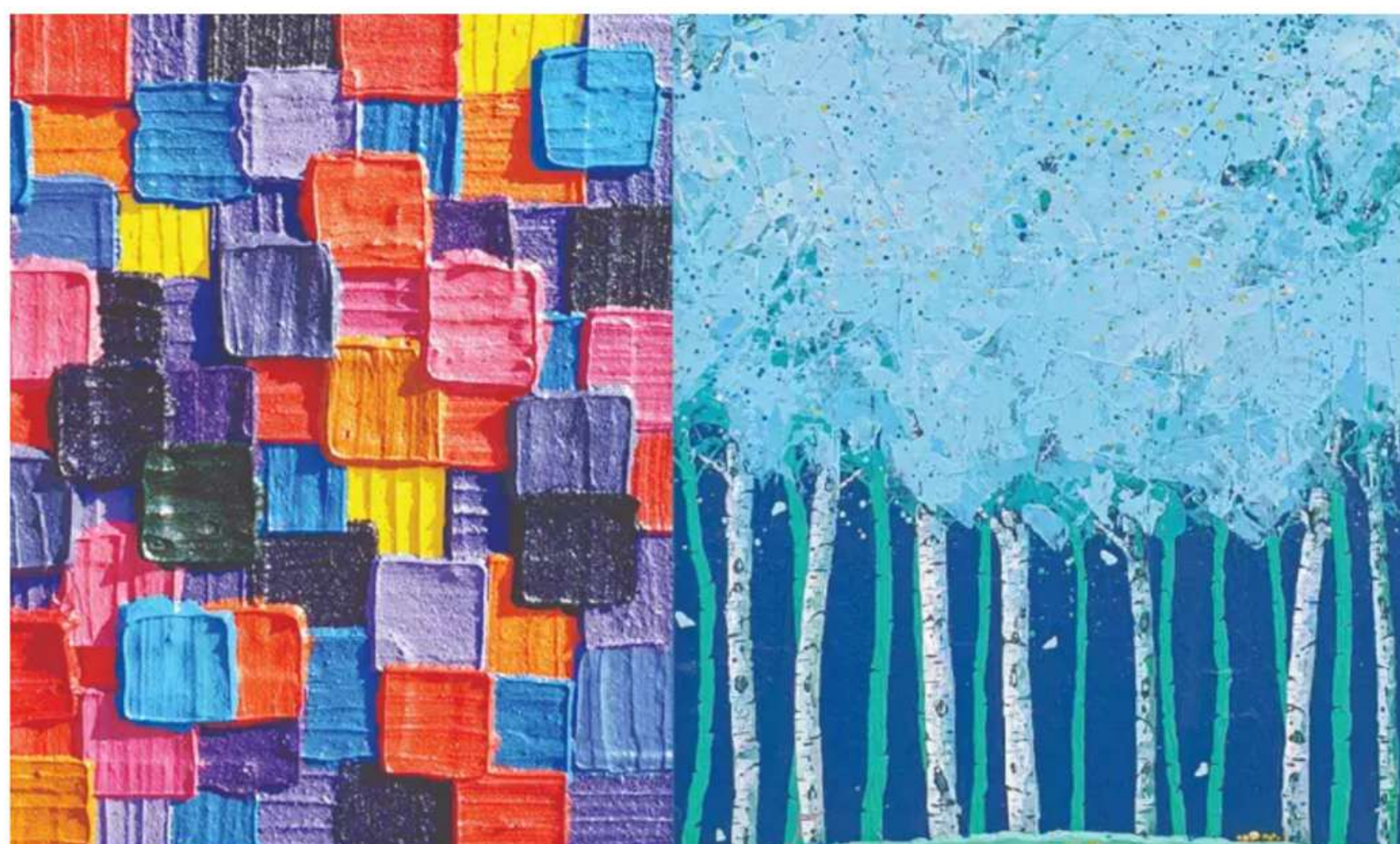
Artworks of Korean and Indian artists at the InKo Centre.

CHENNAI: Onwards... Together, an Indo-Korean exhibition delves into the unique yet intertwined artistic paths of India and Korea. The exhibition, first held in Pyeongchang, Korea, is now presented in Chennai.