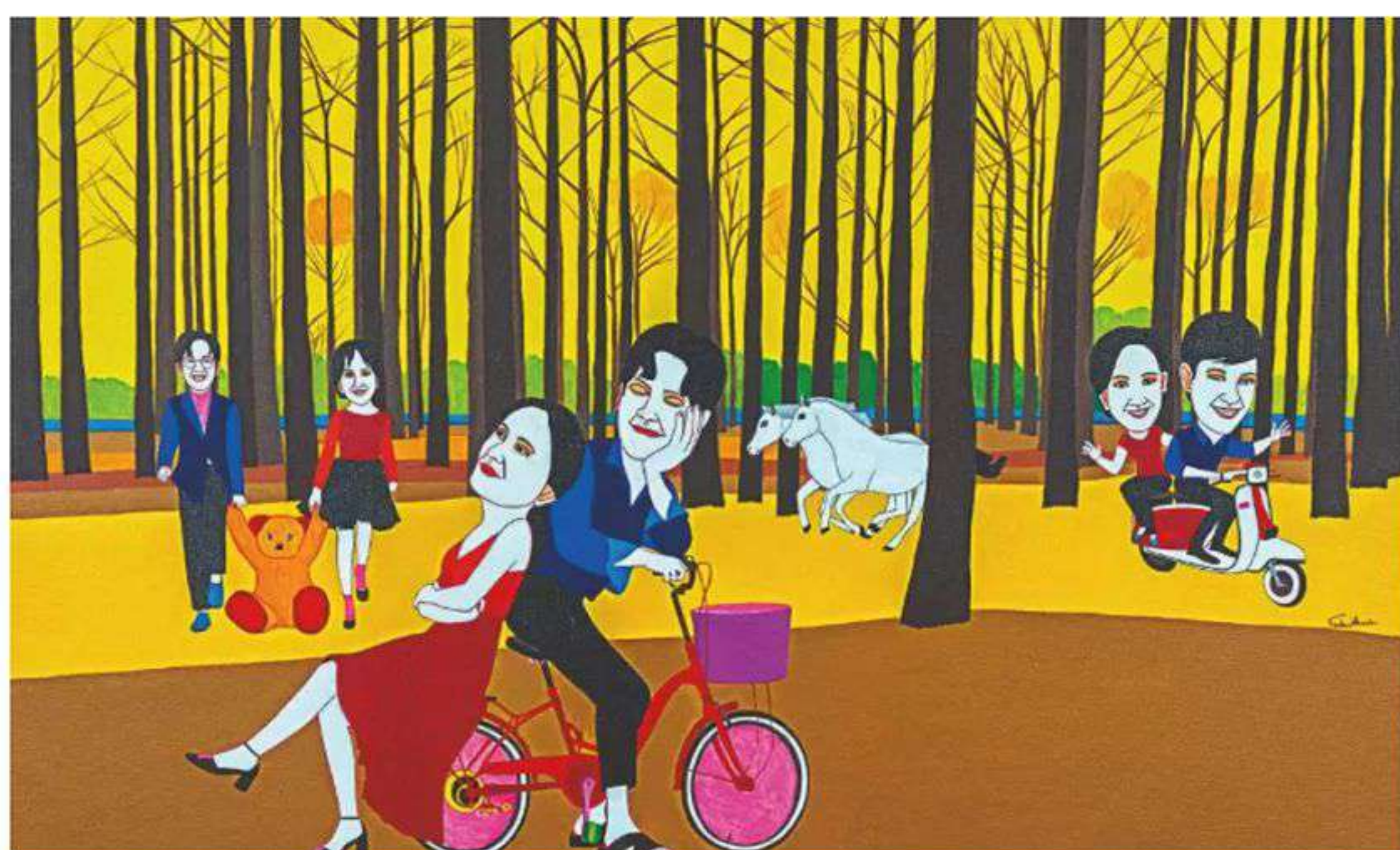
Work by Farhad Hussain

DTNEXT Bureau | 5 Feb 2024 7:00 AM (Updated: 5 Feb 2024 7:00 AM )